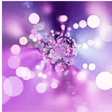
Lister (tcmmediainfo) - [e:\Demo Music\tubebackr-we-feel.mp3]